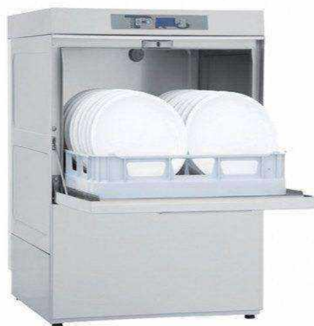
Under counter Dishwasher