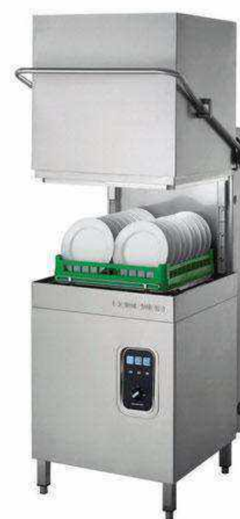
Hood type Dishwasher

Keep it clean! Cleaning dishes has never been this easy & convenient! Do talk to us to check the wide range of dish washers we have! nge of hot and cold equipment will enthrall you to buy more from us!