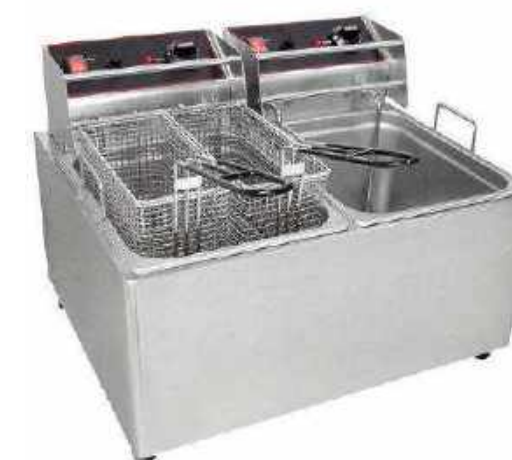
Deep Fat Fryer