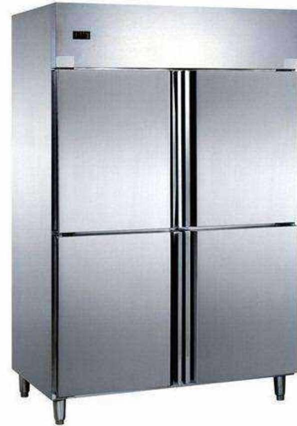
4 Door Refrigerator/ freezer