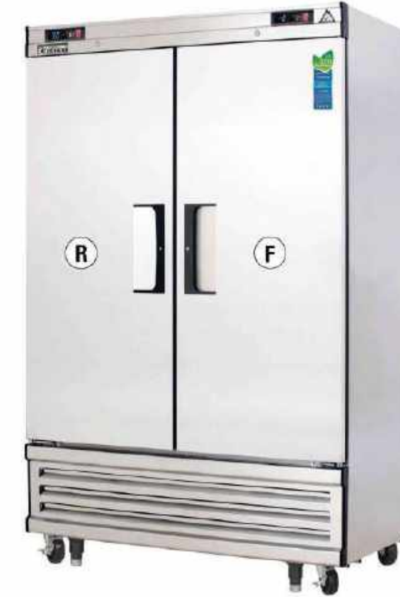
Reach in Refrigerato