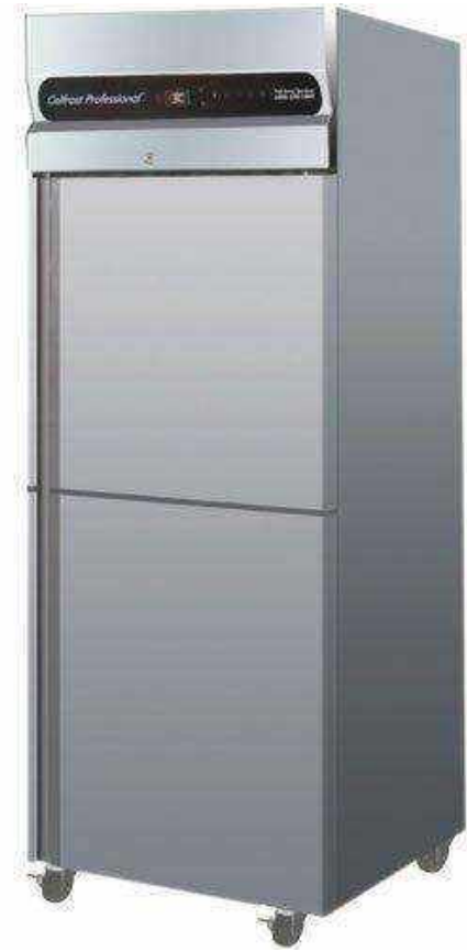
2 Door Refrigerator/ freezer